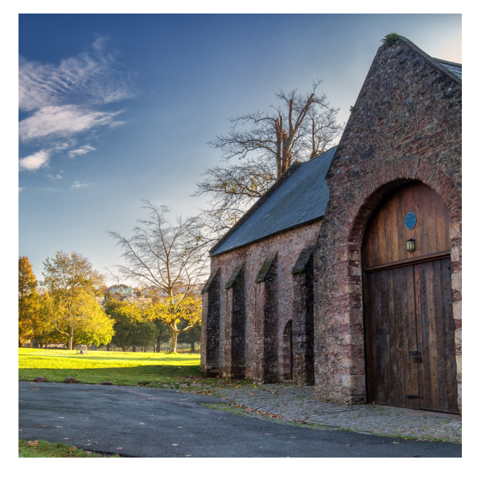
Top Left: Outside the Barn

Owing to the status of the Spanish Barn we recommend only using the venue during the summer months. If you are using the Spanish Barn for your ceremony and reception we offer a minimum hire period of 3-days. With these points in mind we ask that you give this due consideration.